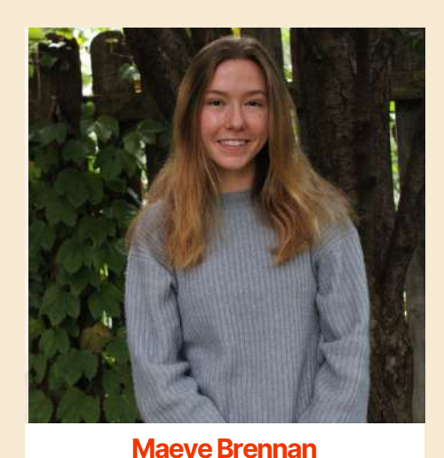
Conc. in History and Literature